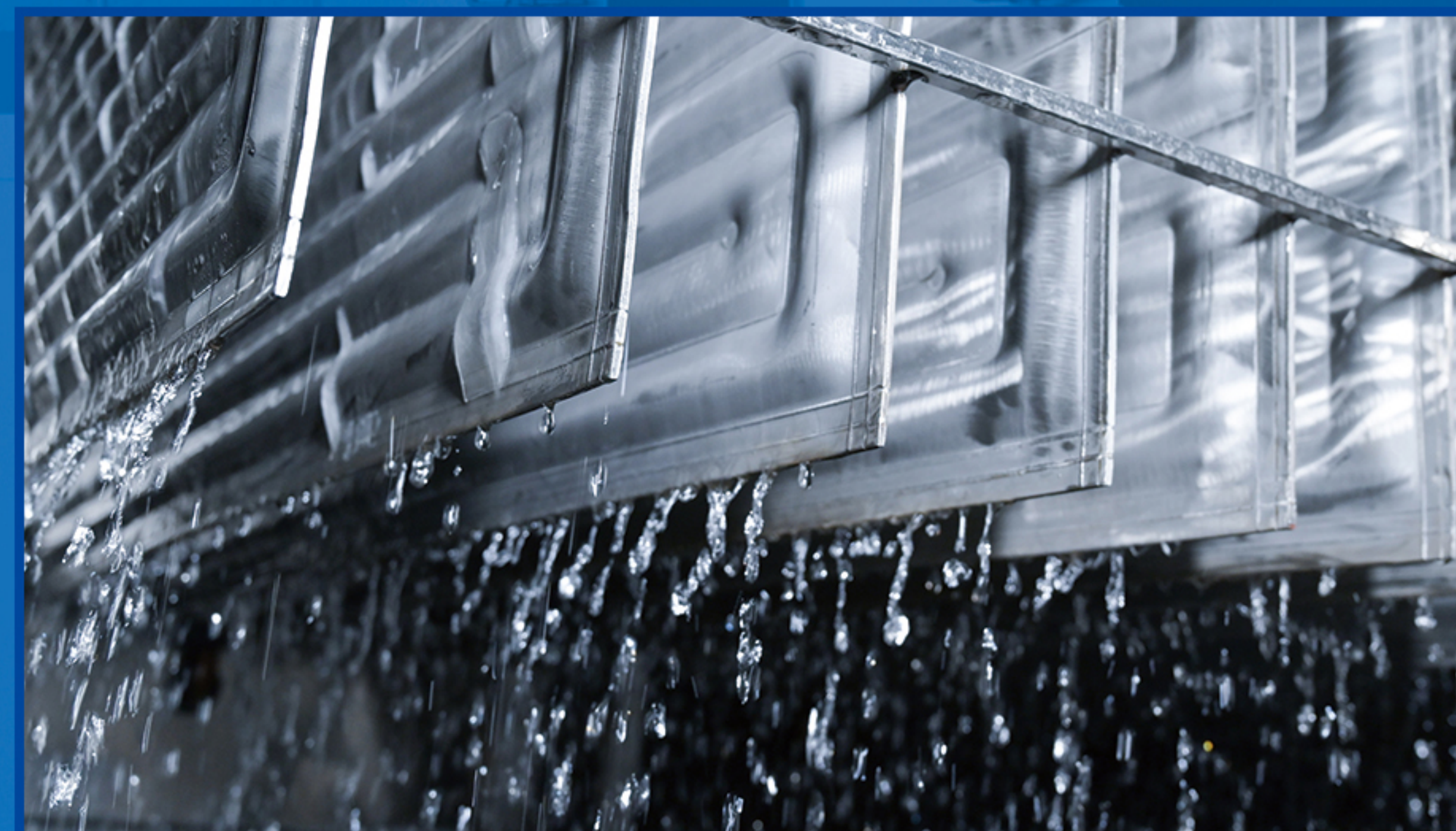
Open-type double-sided ice-making evaporator poses no risk of ice expansion and rupture