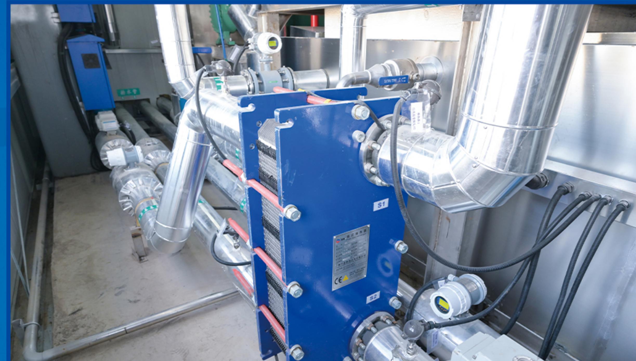
Capable of supplying water at constant pressure and temperature in accordance with end pressure, temperature, and flow requirements