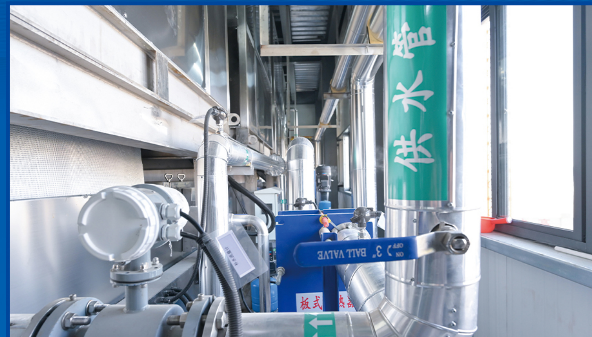
Providing ice water supply on demand